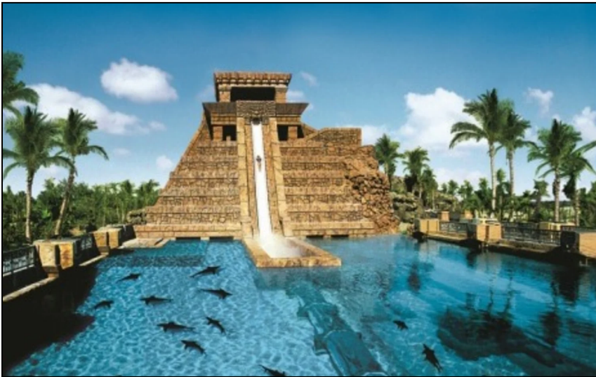
Full view of The Leap of Faith